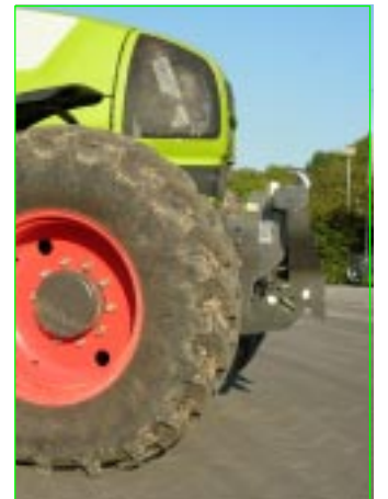
MDI 4 Folded. Minimal overhang from the front face.

Important: Only the parallel folding principle ensures functionality of float mode.