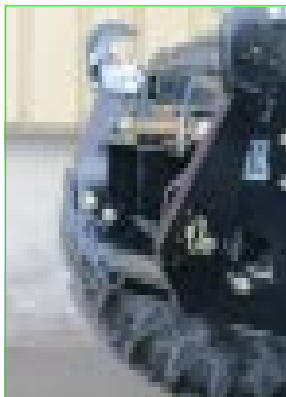
Compact: Minimal overhang from the front face.